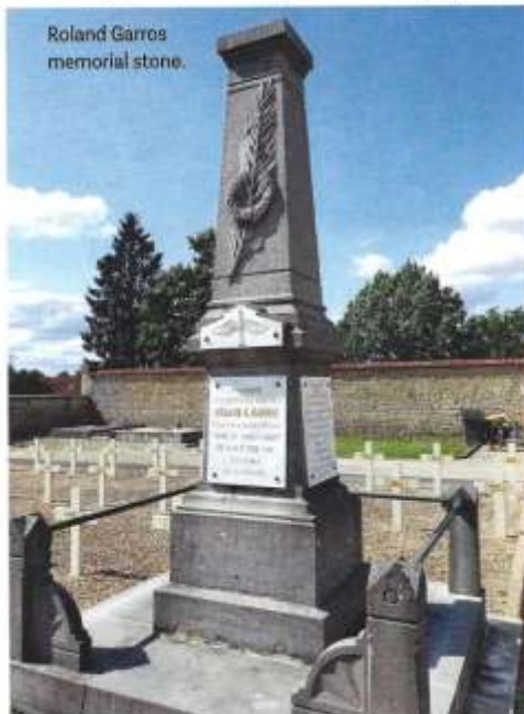
Roland Garros memorial stone.

4 - An eponym is a word based on or derived from a person's name. Who gave his name to a device that measures fluid flow velocity?